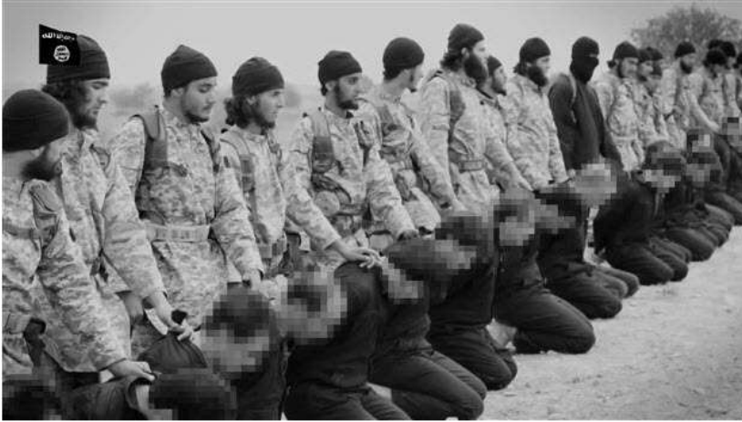
An image grab taken from a propaganda video released on November 16, 2014 by al-Furqan Media allegedly shows members of the ISIL jihadists preparing the simultaneous beheadings of at least 15 men described as Syrian military personnel.

174 Brigadier General S. L. A. Marshall, Chief Historian of the European Theater of Operations in World War II, in a series of interviews with American riflemen, concluded that only 15 to 20 percent of them fired their weapons at an exposed enemy soldier. His conclusions have been supported by other studies.